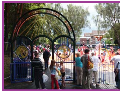
Opening day at Bulwell Bogs

As the majority of the site lies within the flood plain of the River Leen detailed negotiations with the Environment Agency were needed in order to gain the required approvals from them. In addition an existing 900mm diameter combined sewer runs under the site at an approximate depth of 4m below finished ground level. This required early consultation with Severn Trent and Nottingham City Council Drainage Engineers to ensure required easements were observed.