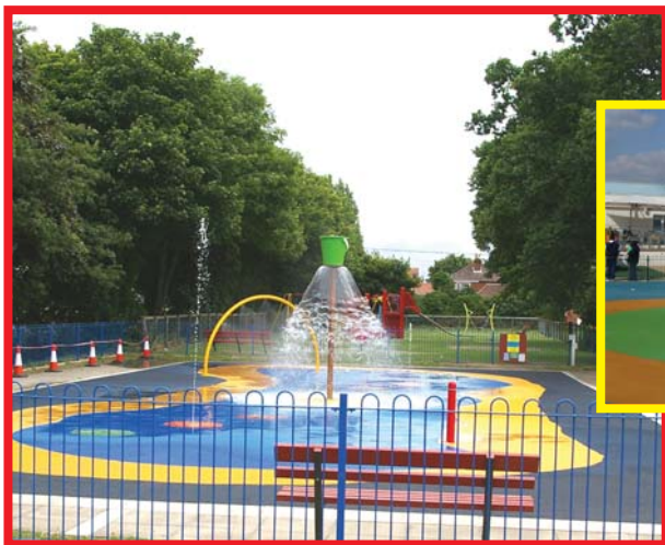
This splash park replaces an old paddling pool at Eling, near Southampton

SSP WaterPlay's accreditation demonstrates that the business meets acceptable standards of health and safety compliance and that the business can adequately manage health and safety issues.