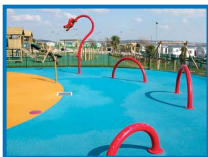
The Welsh Dragon at Trecco Park

SSP WaterPlay has continued to develop themed waterplay systems for commercial site operators. A large 500m 2 splash-park was recently completed at the Trecco Bay Holiday Park at Porthcawl, Wales as part of a £7 million investment programme in the site. Trecco Bay is one of the UK's largest holiday parks and the new splash-park is packed with features including swaying palms that dump water and a red dragon centre-piece to add a bit of Wales into the tropical scene.