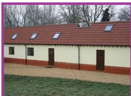
SSP's new offices in Odiham

We've now got the space to expand the business and a beautiful environment in which to work". The offices provide ample accommodation inside, plenty of parking and a 6 acre paddock as well.