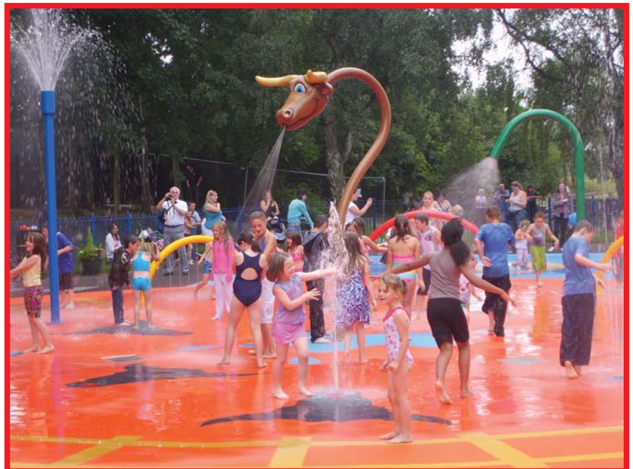
The splash park has been busy every day since it opened.

Nottingham City Council Resources Department was commissioned by NCC Community and Culture to manage this new water park scheme from design through to completion. The project team worked closely with the 'Friends of Bulwell Bogs', the Sports Leisure and Parks Development team and SSP WaterPlay to develop a unique and exciting theme led water play area in the heart of Bulwell.