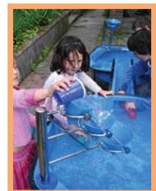
Plug In & Play combines learning with fun

steel, each table is preassembled and easy to install. The Plug In features can be removed for easy storage and each unit is year-round weatherproof.