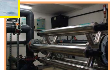
The plant room contains all the pumps and filtration equipment

important in this scheme as with all others that SSP WaterPlay installs. All features are designed to conserve water and the re-circulating system feeds water back through the UV filtration plant and filters constantly to maintain standards despite the size of the splash park and the expected heavy use.