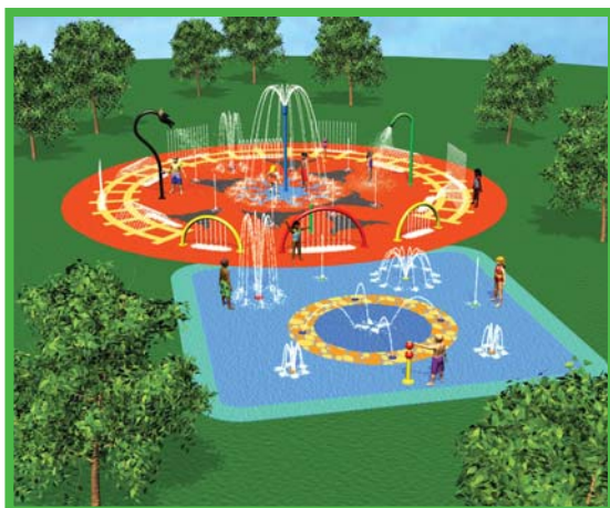
The original CAD design for Bulwell Bogs

The scheme includes a splash pool, an exciting range of water jets, curved curtains of water, sprays and 'Sound Sticks' incorporated into the play equipment together with a number of bespoke paving, gate and fencing elements that use 'bull' and 'well' motifs to signify the