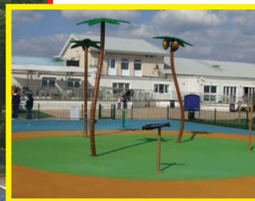
400m 2 splash park at Trecco Bay, Porthcawl